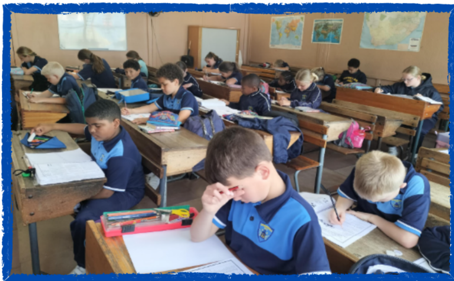
A class from Gordon's Bay Primary school

The class is organized by the traditional model in which the students are in pairs facing the blackboard and the teachers desk. This organization encourages working by pairs and independence. The school offers hours of work for the students to have a space where to finish their homework. There is a teacher to the students disposition in case of doubts.